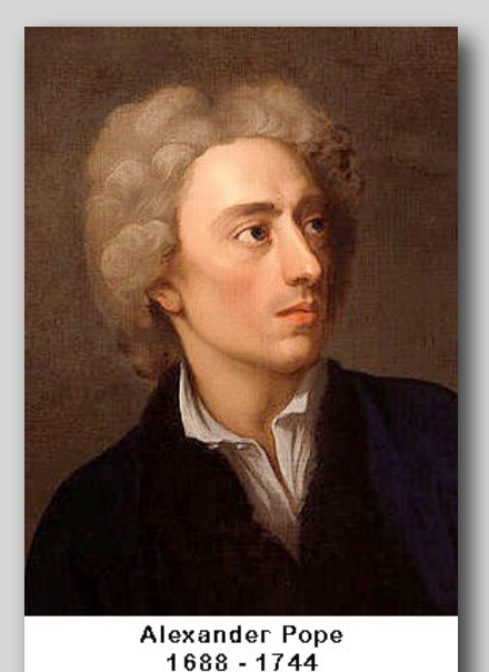
'To err is human. To forgive divine"

Firstly, what is an error? In its simplest form, it is "anything in which the result was not what you expected". Thus, if you are divorced, you made an error when you married. Interestingly, some of us go on to repeat the same error more than once. (has anyone been divorced twice?)